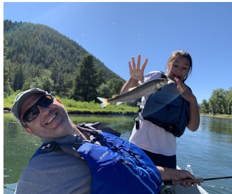
Fly Fishing OR flying fish