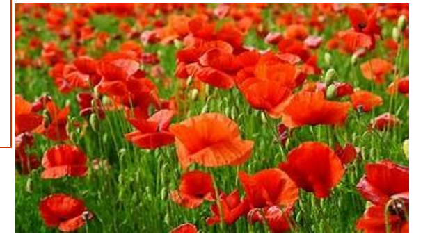
Poppy: Flower of the Month

Over the course of its history, Blackhawk has been served by 9