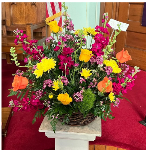
Flowers purchased by the church for the Ken Musson funeral services.

Presbytery USA is grateful for our $5,000 stewardship for the Disaster Relief Ukraine Refugee Program.