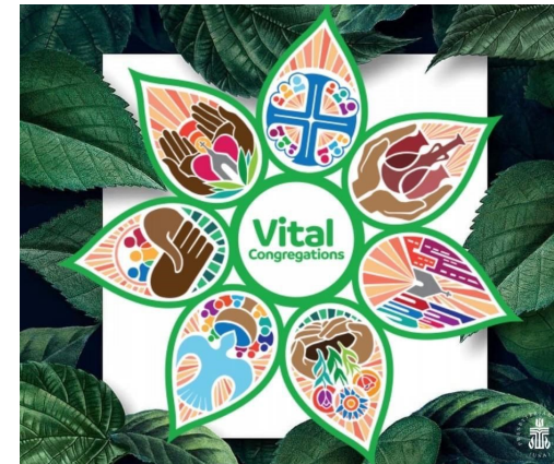
This was on the Blackhawk website with an article on Matthew 25.