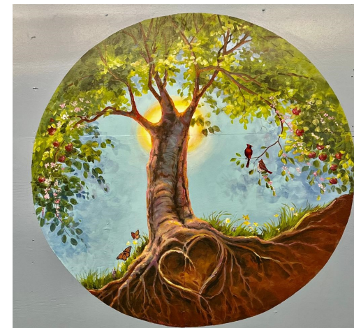
Here is a picture of the mural that was recently painted by Deana Schoolcraft of Saybrook on the wall of the Gibson Area Food Pantry.