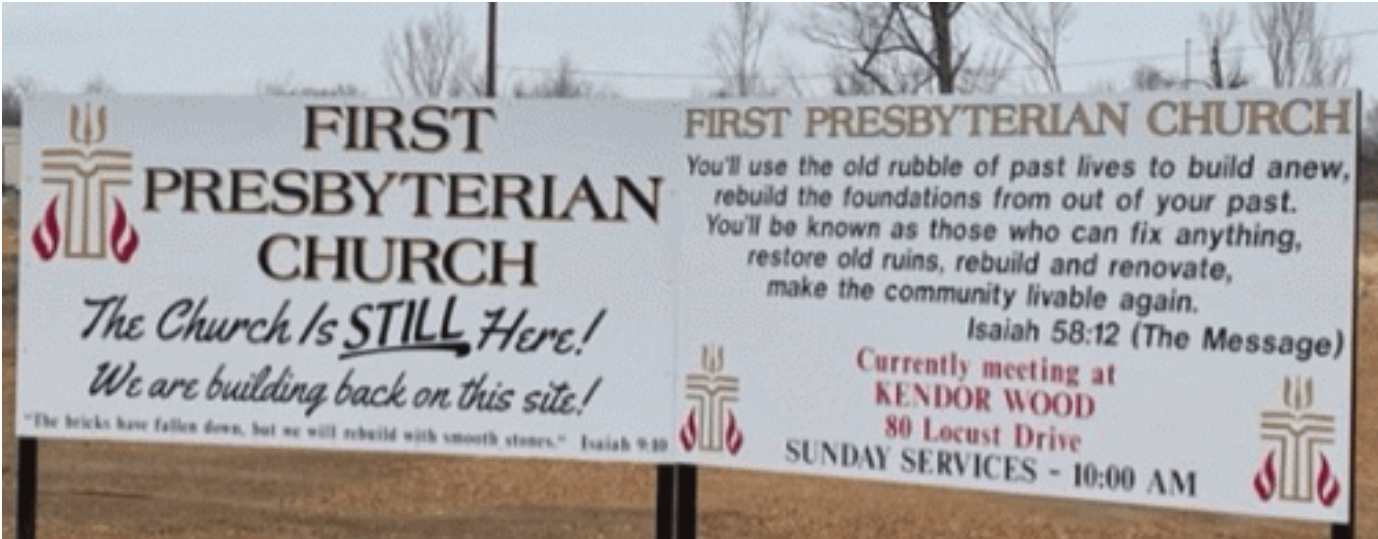
The plans for the First Presbyterian Church in Mayfield Kentucky are reflected in this sign on the site where the church’s more than 100 year old building once stood. The building was destroyed in December of 2021 by a tornado. Our church sent $5,000 to help them with their rebuild.