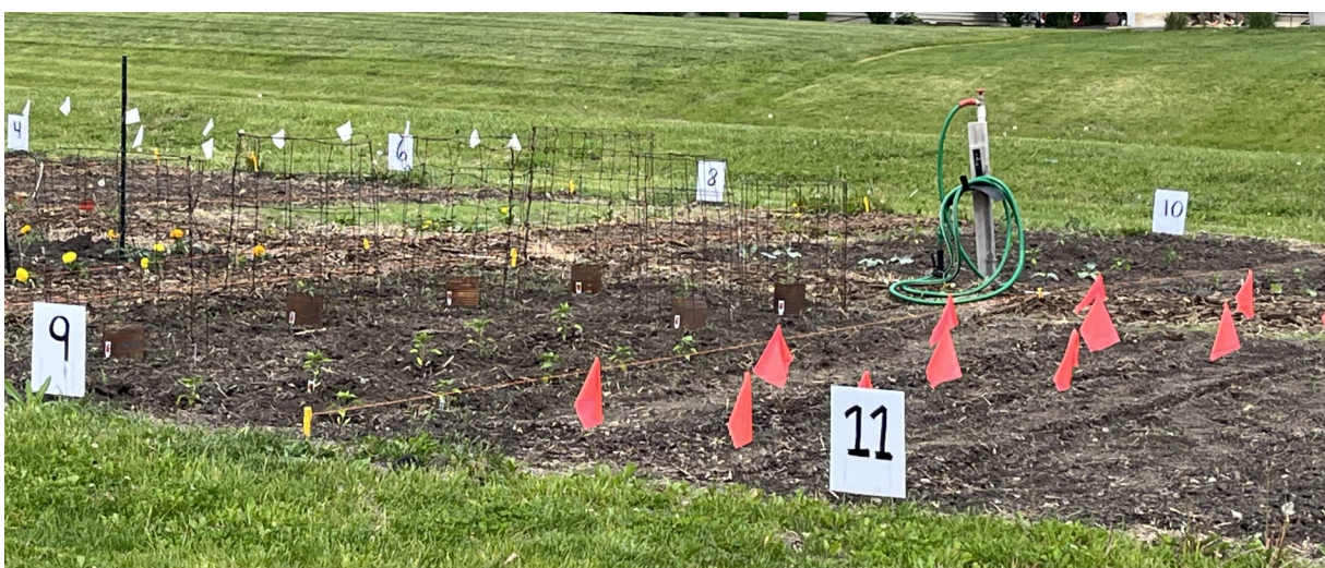
These pictures show the passion, knowledge and enthusiasm of the 2023 gardeners at our Community Garden at Railside Golf Course this year. It's going to be so much fun watching everything grow. Thank you Gary Reiners for offering to cut the grass around the garden. It is greatly appreciated!