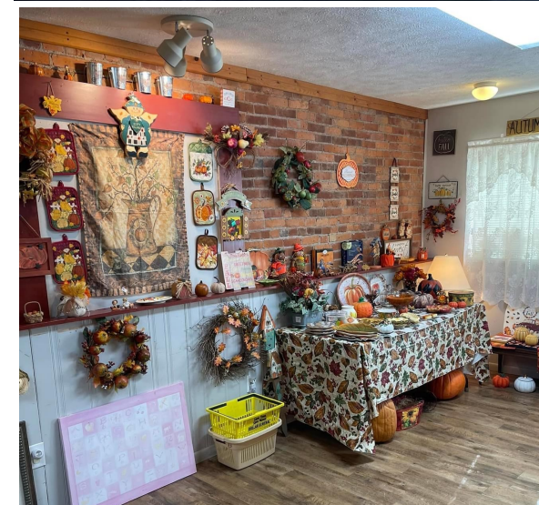
Session approved a $2000 donation to Shepherd's Closet & Closet Too. The emergency food pantry in Shepherd's Closet and the thrift stores are so important to those in need in our community. Stop in and check out the upgrades recently made to both stores.