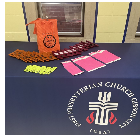
Thank you Harvest Fest Committee for dropping off wrist bands, drink tickets and Huggies as a thank you to the church for being a sponsor for the Gibson City Harvest Fest held on September 8th and 9th.