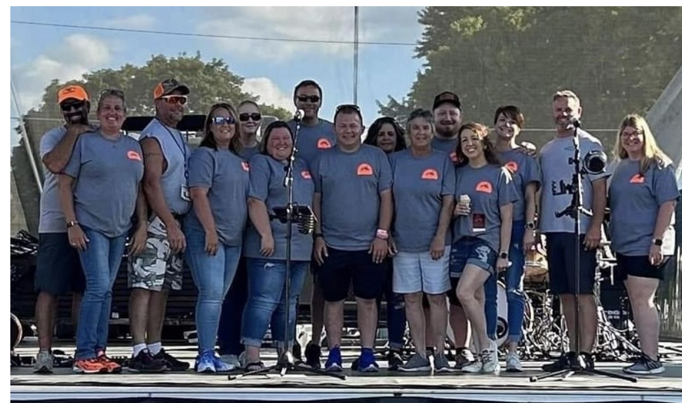
The amazing Gibson City Harvest Fest Committee put together another great Harvest Fest celebration. It involved a lot of planning and hard work by these volunteers. This group also puts together the Christmas Parade event. Our Church gave each member of the group a $50 Horsch Radish gift card to show our appreciation.