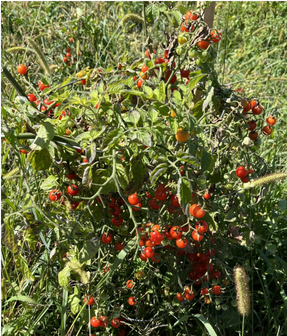
The Community Garden started by our Church continues to be abundant with Produce and Flowers. What a blessing it has been to our community.