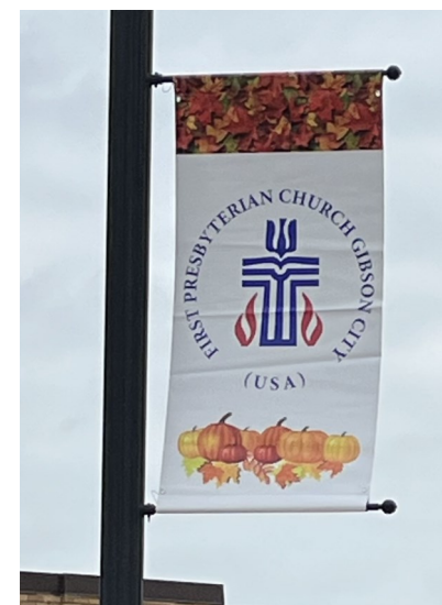
Fall banners for the City Light poles purchased by our Church were hung in time for the Harvest Fest Celebration.