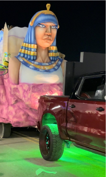
Floats from the Mardi Gras Parade in Mobile Alabama.