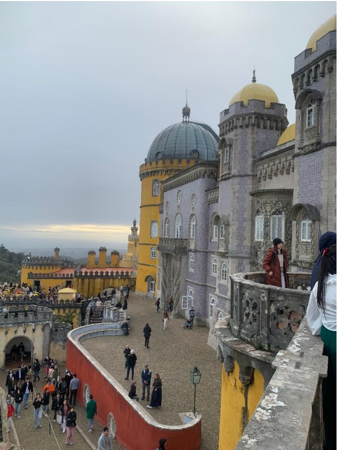
Some of the buildings they saw, including a church built 850 years ago, at which they attended services.