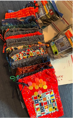
Pictured are 17 pairs of boys shorts, 20 pairs of boys underwear and 12 bouncing balls that were sent to the Dress A Girl Dress A Boy campaign under the Hope for Women International Organization. The shorts were made by Ellen Hanks with assistance from other members of the Gibson Girls HCE Unit. Dresses and shorts are sent to children in need in many countries throughout the World including Uganda and the Appalachians.