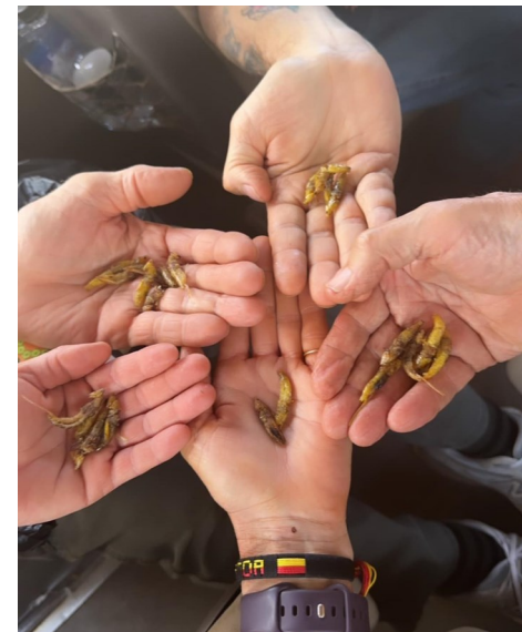
Eating grasshoppers! Yes!!!