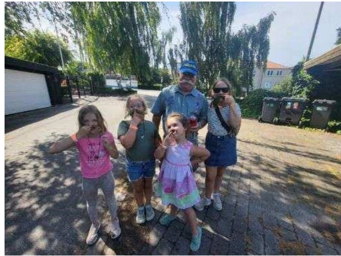
Everyone needs to have a mustache like Morfar.