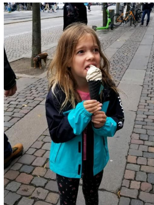
Eating a licorice ice cream cone!