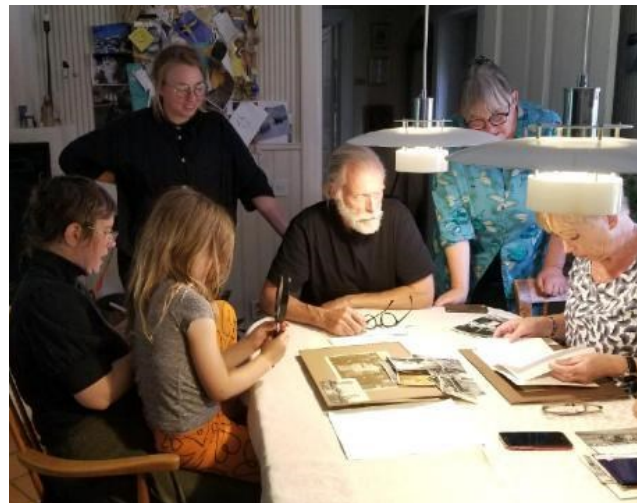
Exchanging pictures with our distant cousins.